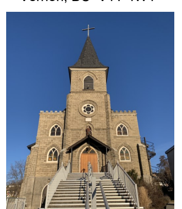
Mass Times 5:00 pm Saturday 8:30 am Sunday 7:00 pm Sunday