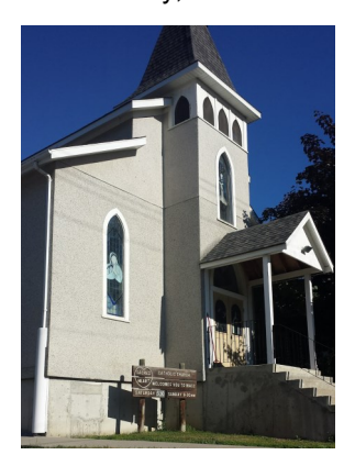
Mass Times 5:30 pm Saturday 9:30 am Sunday