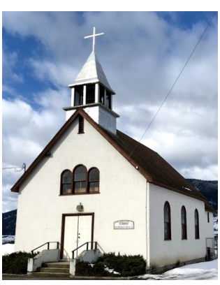
Mass Times 12:00 pm Sunday St Benedict—1st, 3rd and 5th Sunday St Theresa—2nd and 4th Sunday