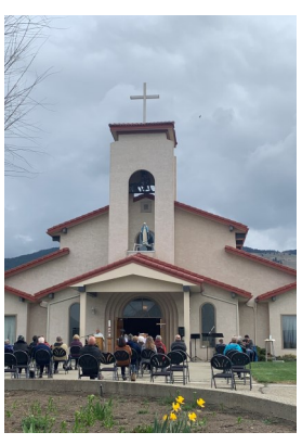
Mass Times 10:30 am Sunday