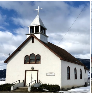
Mass Times 12:00 pm Sunday St Benedict-1st, 3rd and 5th Sunday St Theresa—2nd and 4th Sunday