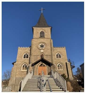
Mass Times 5:00 pm Saturday 8:30 am Sunday 7:00 pm Sunday