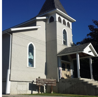
Mass Times 5:30 pm Saturday 9:30 am Sunday