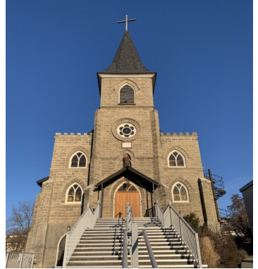
Mass Times 5:00 pm Saturday 8:30 am Sunday 7:00 pm Sunday

Sacred Heart Church 2202 Park Ave Lumby, BC V0E 2G0