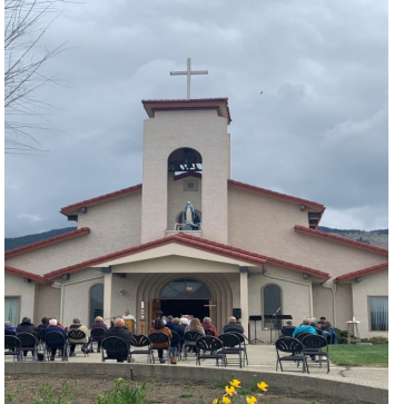
Mass Times 10:30 am Sunday