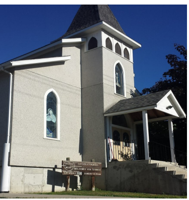
Mass Times 5:30 pm Saturday 9:30 am Sunday