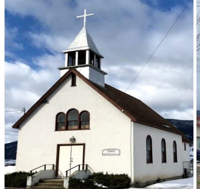
Mass Times 12:00 pm Sunday St Benedict—1st, 3rd and 5th Sunday St Theresa—2nd and 4th Sunday