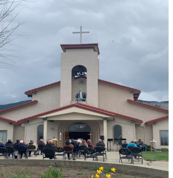
Mass Times 10:30 am Sunday