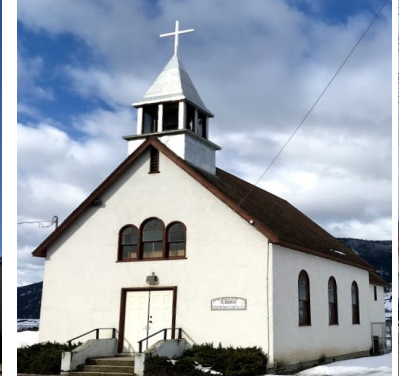
Mass Times 12:00 pm Sunday St Benedict—1st, 3rd and 5th Sunday St Theresa—2nd and 4th Sunday