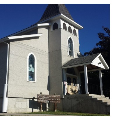
Mass Times 5:30 pm Saturday 9:30 am Sunday