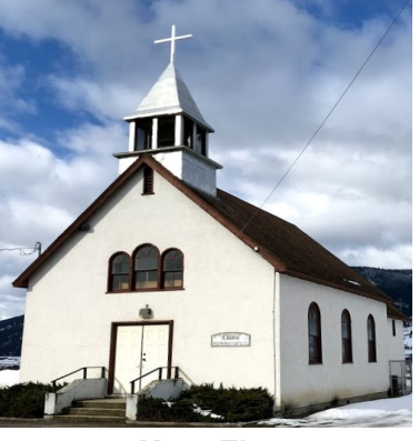
Mass Times 12:00 pm Sunday St Benedict—1st, 3rd and 5th Sunday St Theresa—2nd and 4th Sunday