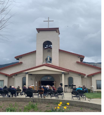
Mass Times 10:30 am Sunday