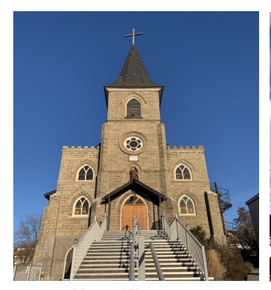
Mass Times 5:00 pm Saturday 8:30 am Sunday 7:00 pm Sunday