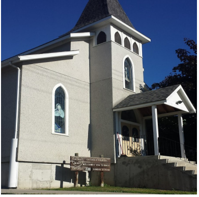
Mass Times 5:30 pm Saturday 9:30 am Sunday